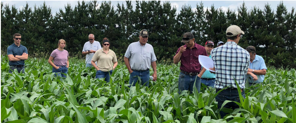
Farmers for Tomorrow Producer-led Watershed Group, 2018.

↑ Private Well Testing and Compensation – AB-21 (Shankland): This bill would create a fund to make private well testing more affordable, increase the number of households eligible to participate in the Well Compensation Grant Program for contaminated wells, and allow well owners to seek compensation from the fund for wells contaminated with nitrate, even if the well is not used for livestock.